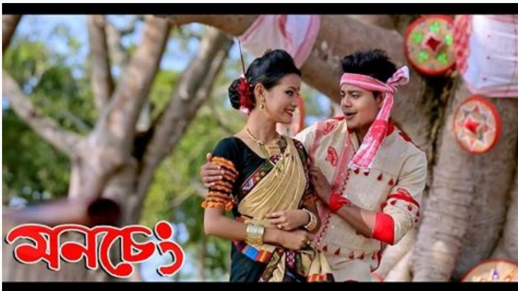
Assamese bihu video song 2018.